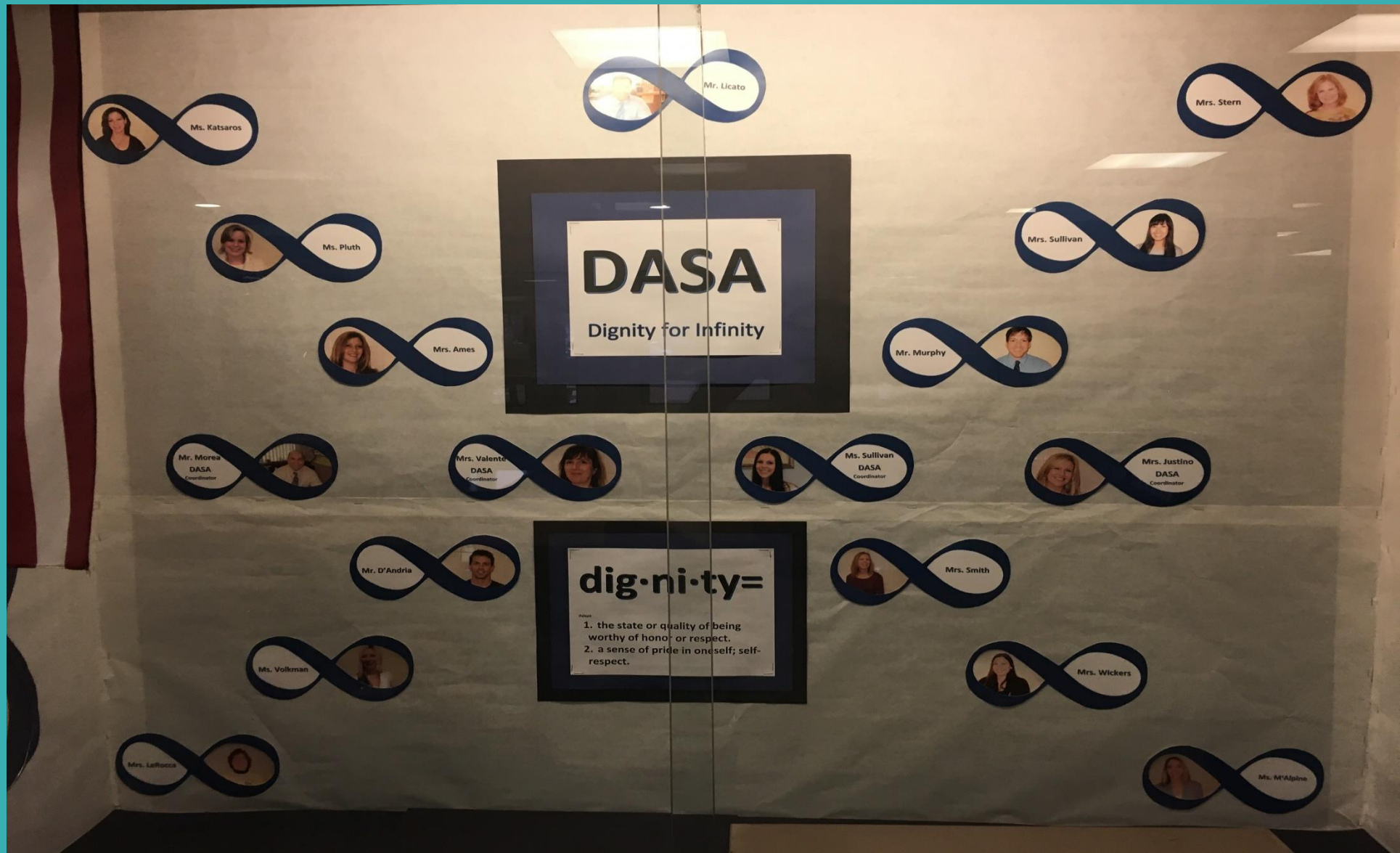
RONKONKOMA MIDDLE SCHOOL DASA TASK FORCE